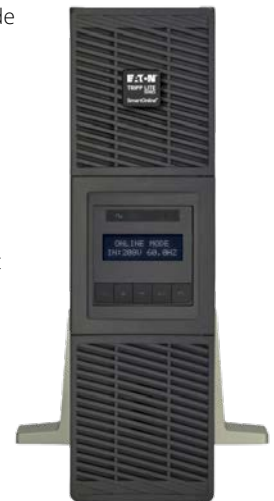
Mount the UPS in a rack or use the included tower stands for vertical placement.

Eaton provides free product support via phone, email or chat. If you have a question or need to find a replacement battery, Eaton can help.